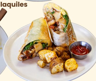
Pork Belly Brunch Burrito