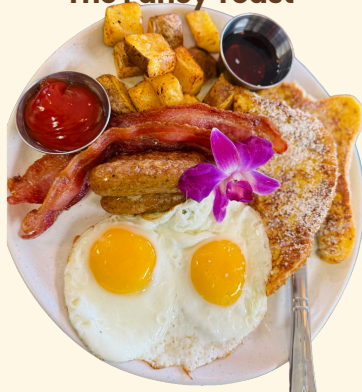
Mia's Breakfast Platter